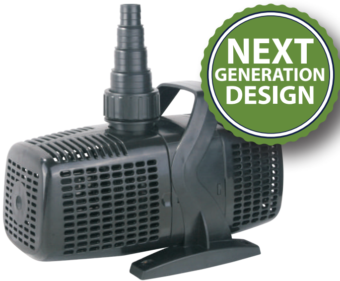
PM2-7500C, PM2-10000C, PM2-15000C & PM2-18000C